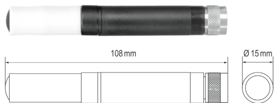
General description and common technical data FHAD 36 Rx (see page 08.11)

06/2018 • We reserve the right to make technical changes.