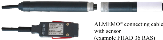
ALMEMO® connecting cable with sensor (example FHAD 36 RAS)

General features, ALMEMO® D6 sensors see page 01.08